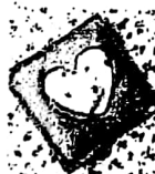
Sample of Reverse Applique