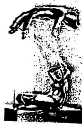
samples of marionette

Horizontal control This type is also known as American control It is universally used for quadrupled animals, as it emulates the basic shape of animal